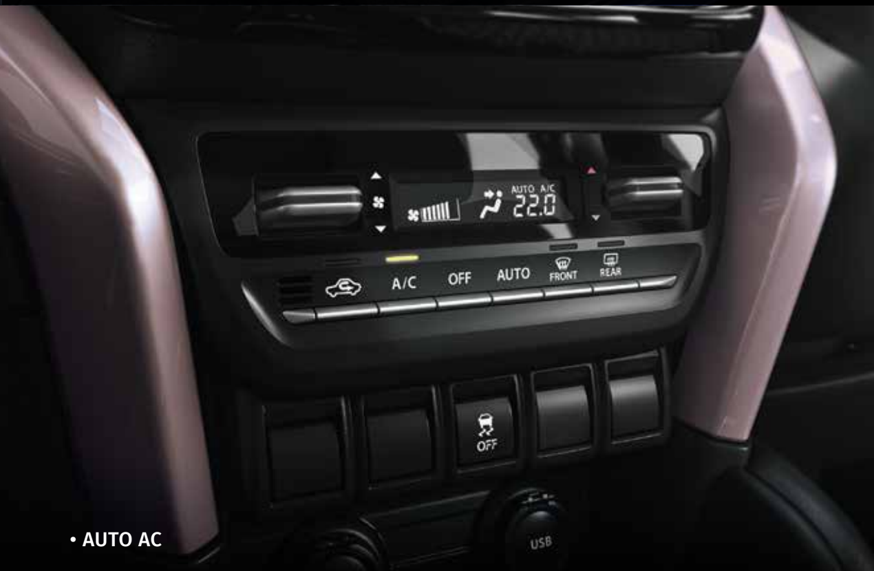
• AUTO AC