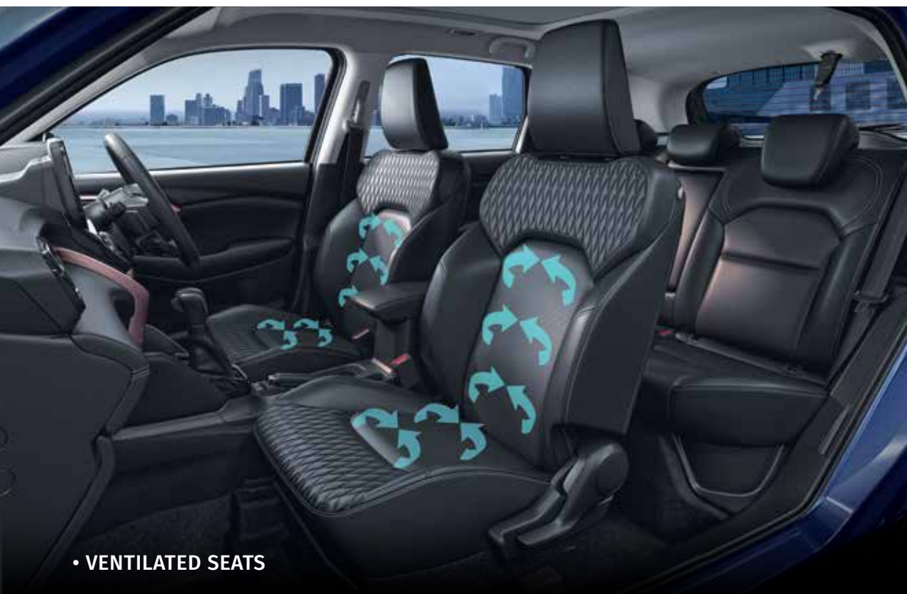
• VENTILATED SEATS