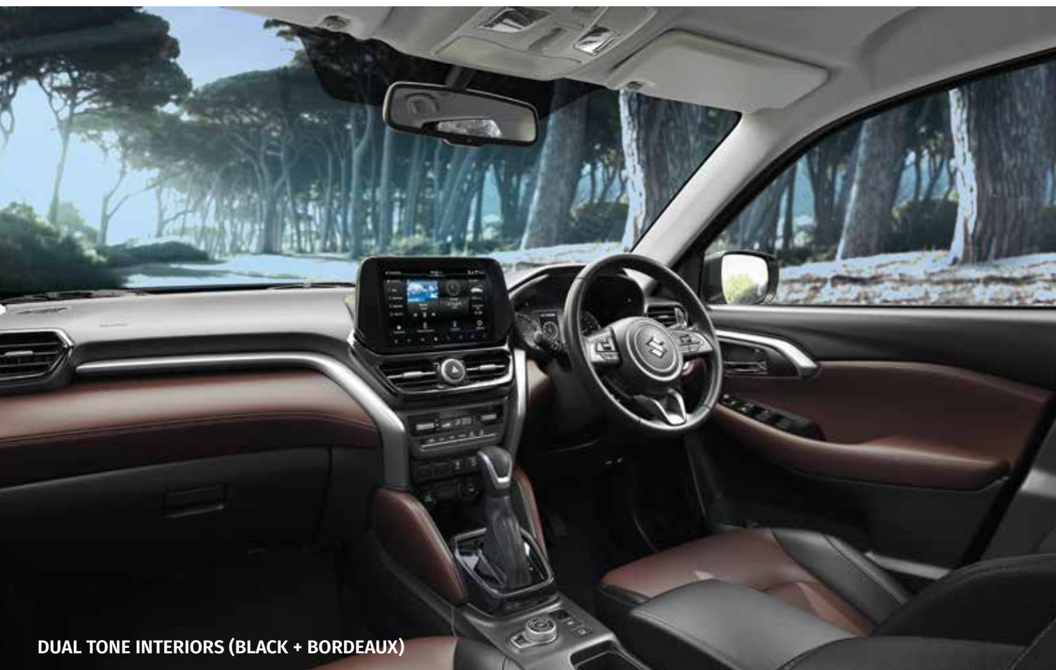
DUAL TONE INTERIORS (BLACK + BORDEAUX)