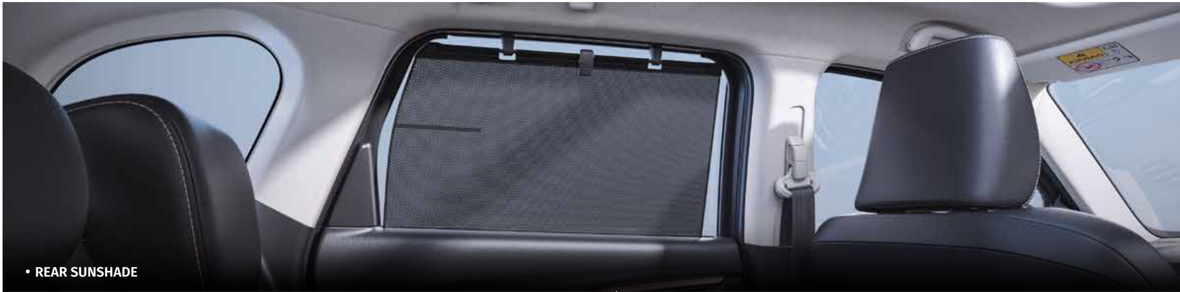
• REAR SUNSHADE