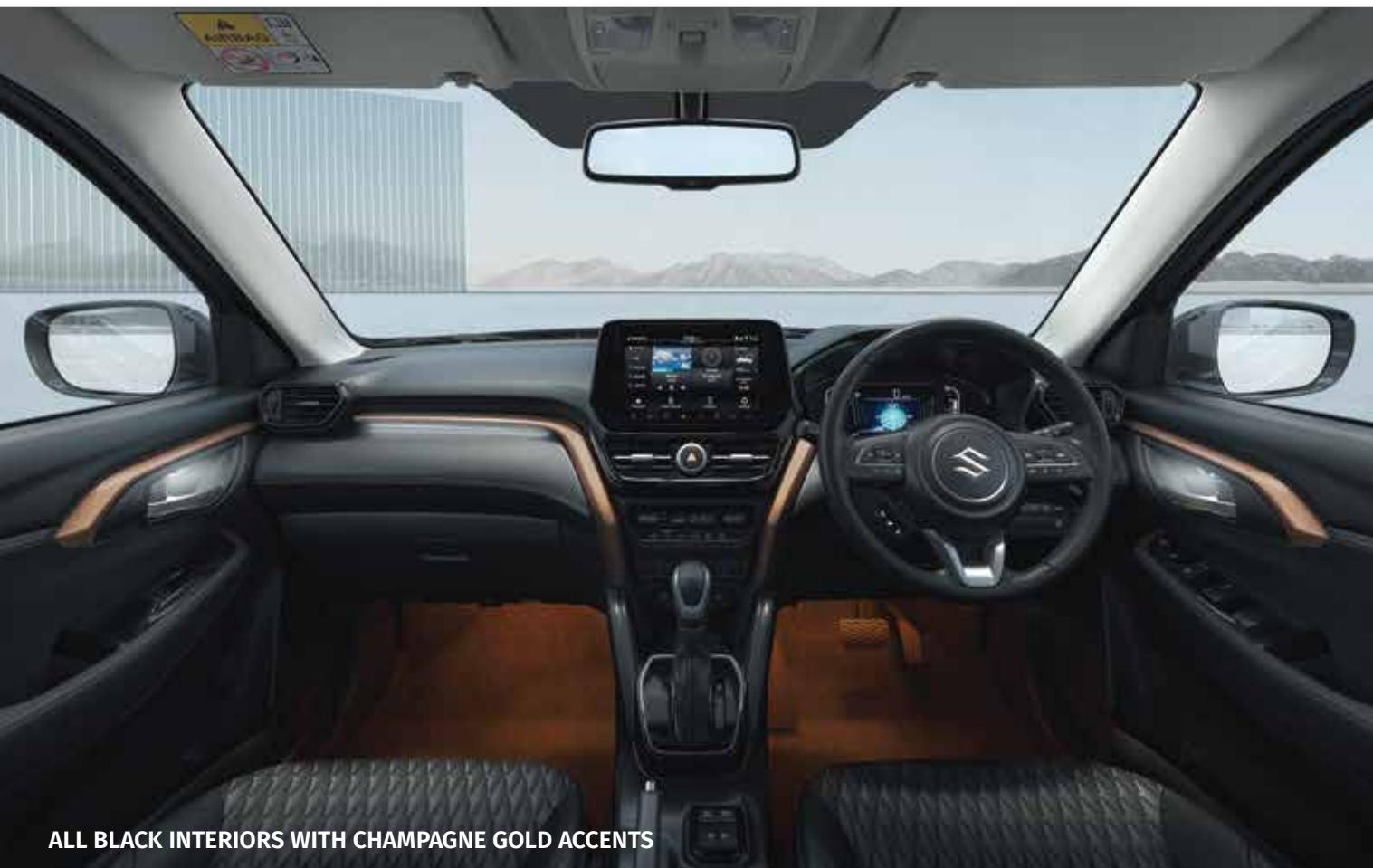
ALL BLACK INTERIORS WITH CHAMPAGNE GOLD ACCENTS