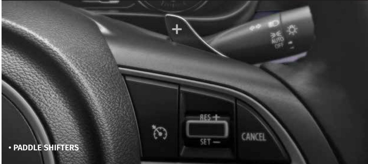
• PADDLE SHIFTERS