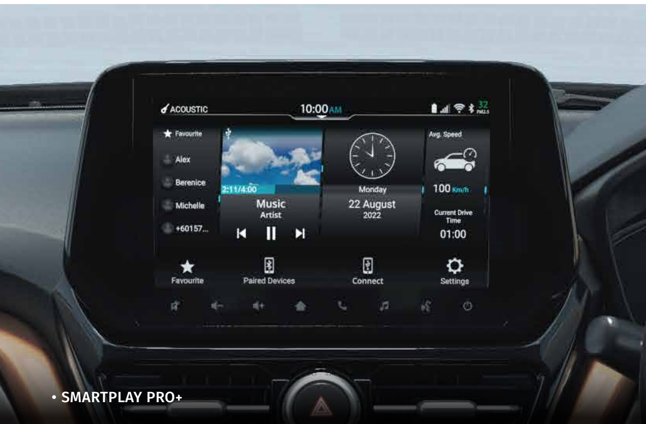
• SMARTPLAY PRO+