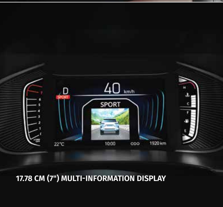
17.78 CM (7") MULTI-INFORMATION DISPLAY