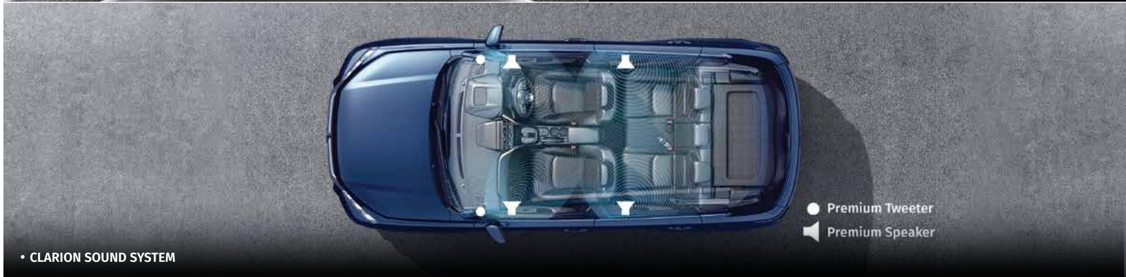
• CLARION SOUND SYSTEM