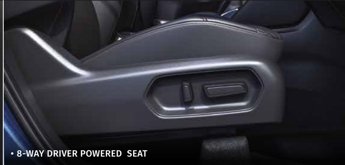
• 8-WAY DRIVER POWERED SEAT