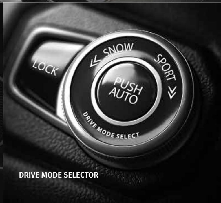
DRIVE MODE SELECTOR