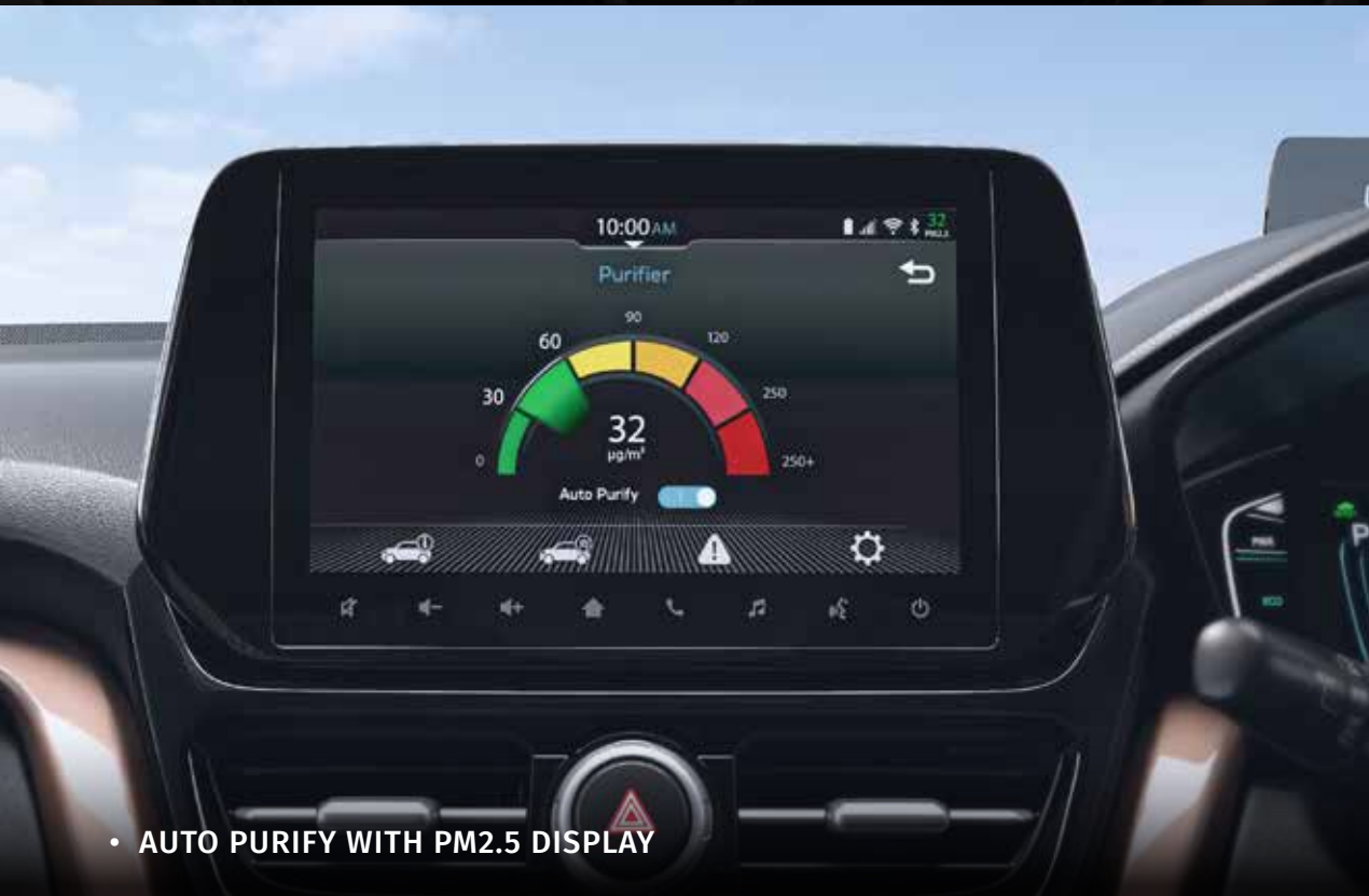
• AUTO PURIFY WITH PM2.5 DISPLAY