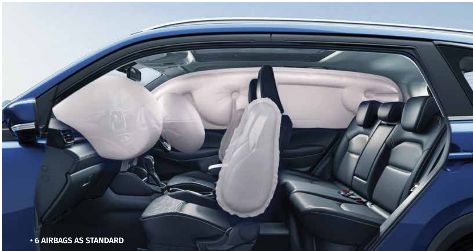
• 6 AIRBAGS AS STANDARD