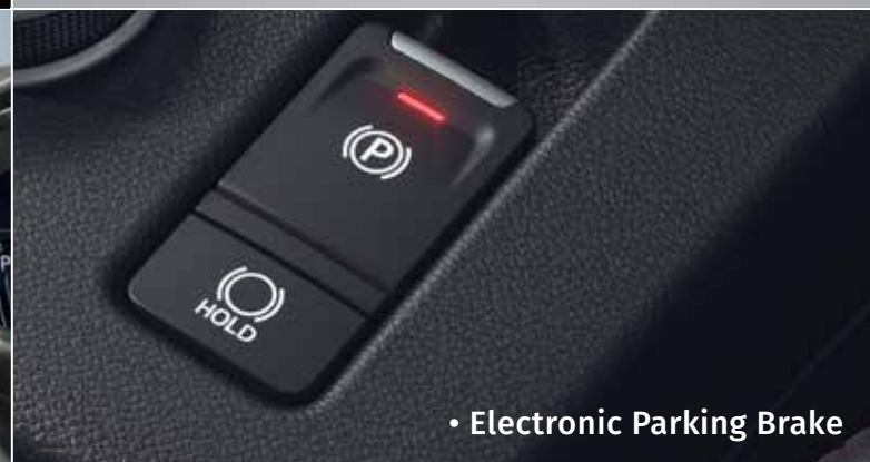
• Electronic Parking Brake