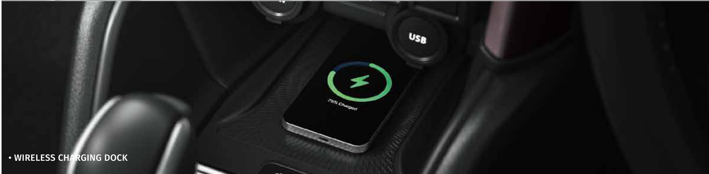
• WIRELESS CHARGING DOCK