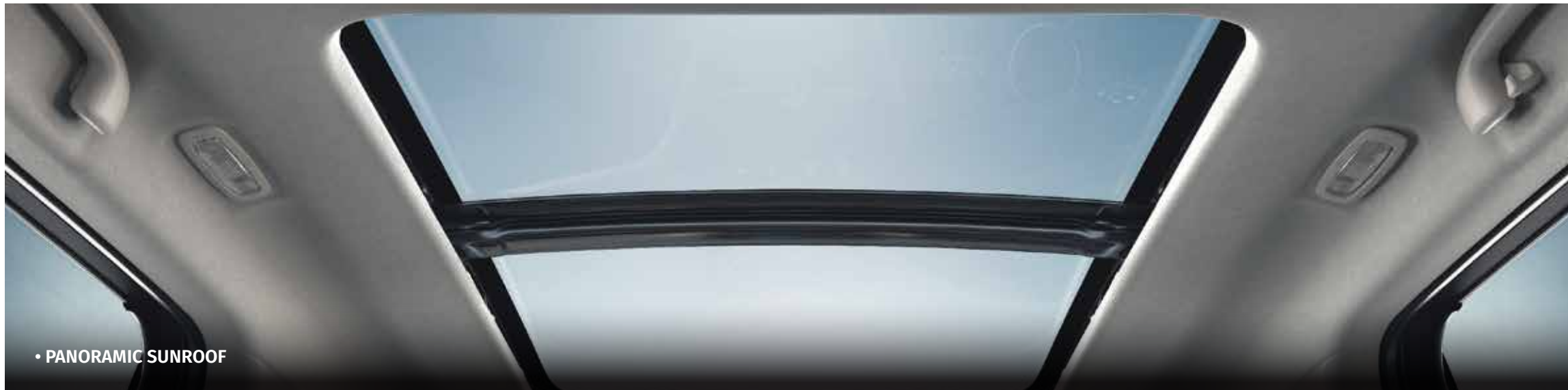
• PANORAMIC SUNROOF